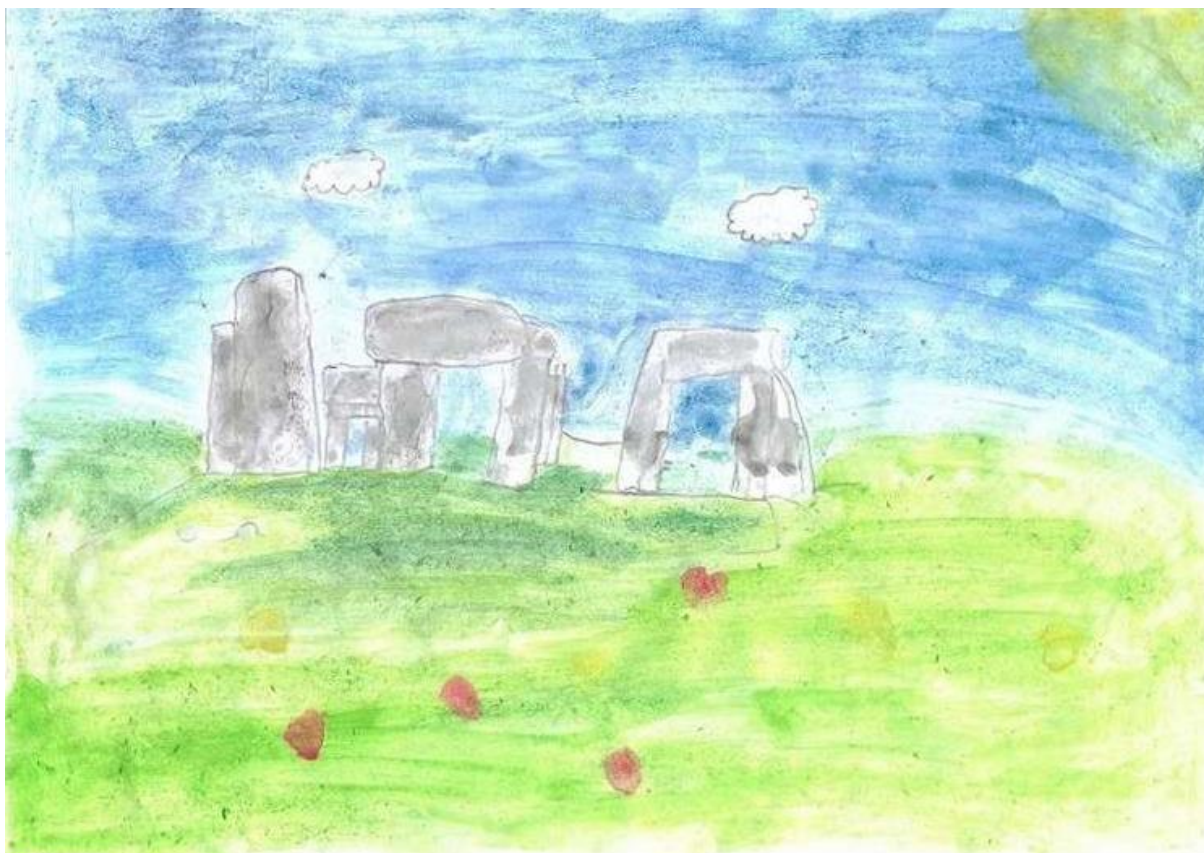
Artwork by pupils from Kirton Primary School. (42423298)